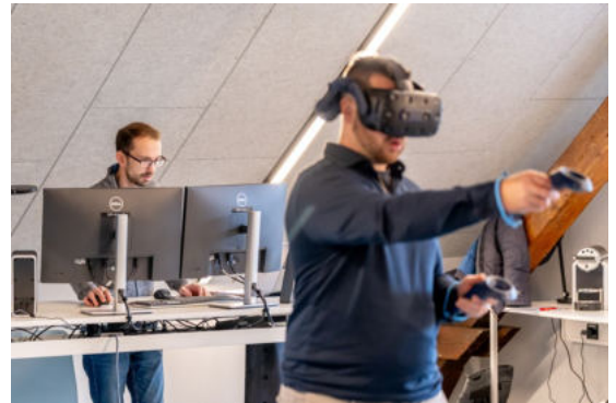
Teach, learn, practice or do all together with our interactive seminars and workshops.