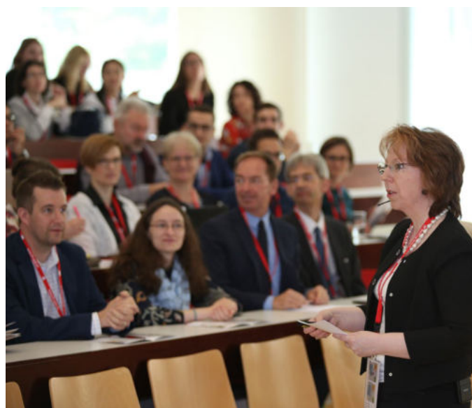
Expand your knowledge and engage in discussions on the latest international and intercultural advancements.