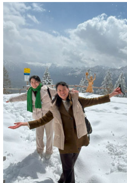
Travel with us to experience breathtaking nature and pure culture of Austria.