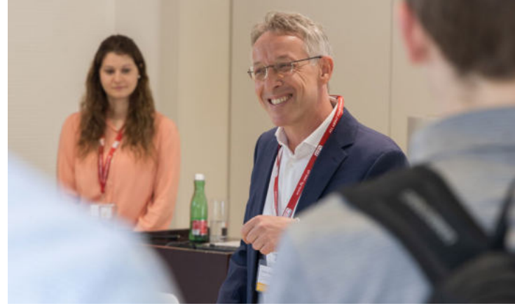
Contribute to engaging discussions and collaborations