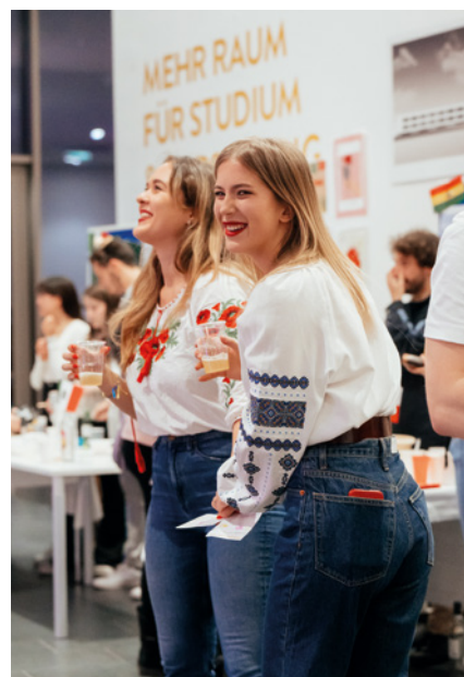
Discover diverse cultures and world cuisines at the International Fair organized by our incoming students.