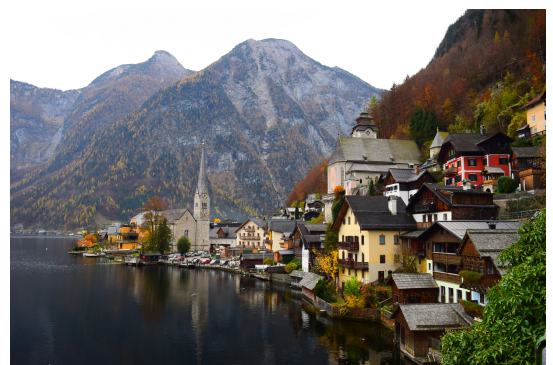
Travel with us to experience breathtaking nature and pure culture of Austria.